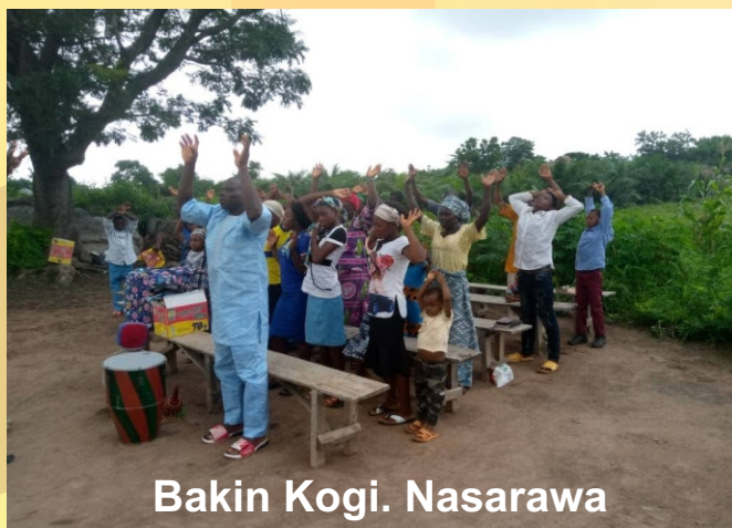
Bakin Kogi. Nasarawa