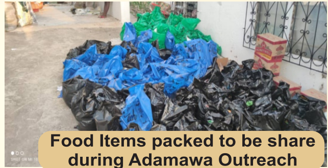
Food Items packed to be share during Adamawa Outreach