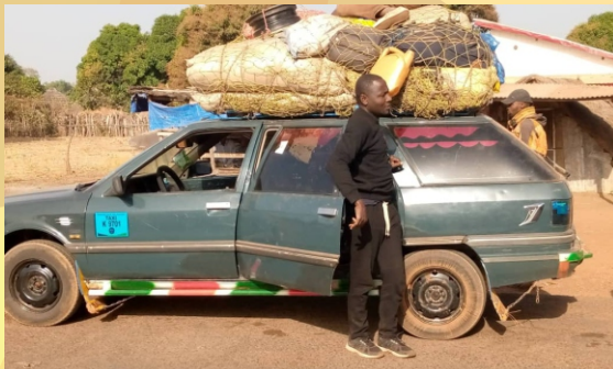
On mission trip to Mali