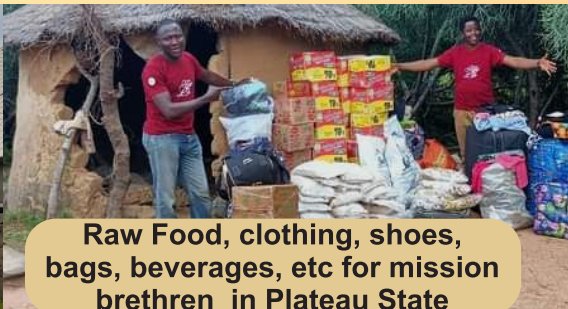
Raw Food, clothing, shoes, bags, beverages, etc for mission brethren in Plateau State