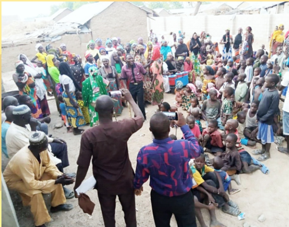
Mission outreach in Gwoza, Borno State,