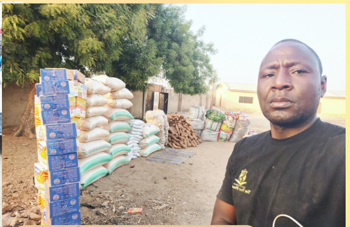
Relief materials shares to an IDP Camp in Borno State