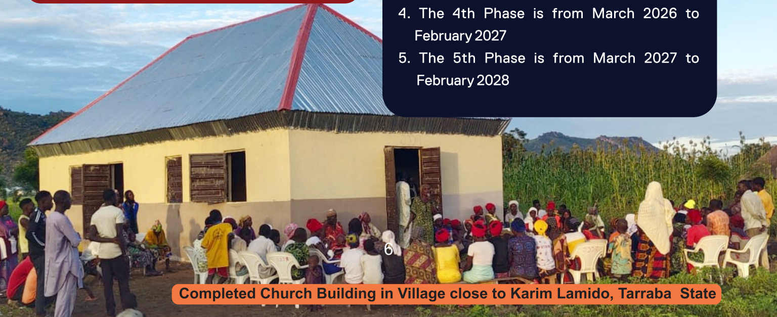
Completed Church Building in Village close to Karim Lamido, Tarraba State