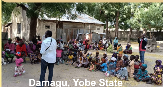
Damagu, Yobe State