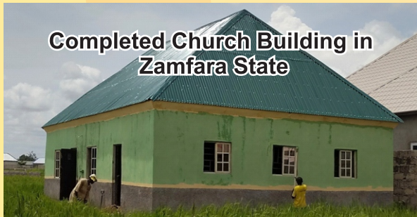
Completed Church Building in Zamfara State

God glorified Himself by helping us build several churches in the Northern Nigeria and other parts of the nation, through the support of individuals, organizations, and ministries who were touched by our efforts among the unreached people groups. So far, by the grace of God, we have facilitated the construction of over 25 missions churches , organized over 200 missions outreaches , and thousands of souls have been saved, including Idols worshippers and muslims.