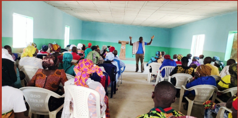
Completed Mission Church building in Chibbok, Borno State

This document is my proposal to build 1,000 Missions Churches and provide support for missionaries working among unreached people groups in Northern Nigeria.