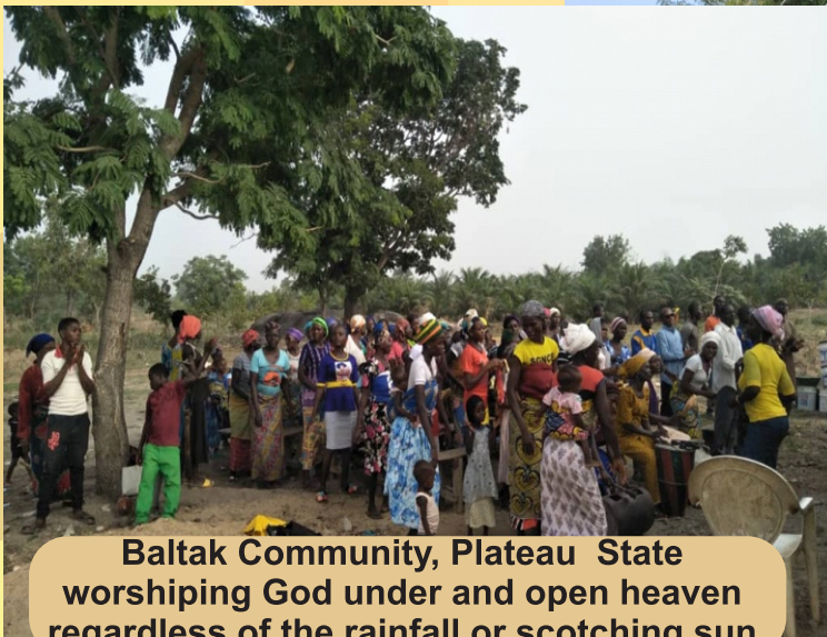
Baltak Community, Plateau State worshipping God under and open heaven regardless of the rainfall or scorching sun