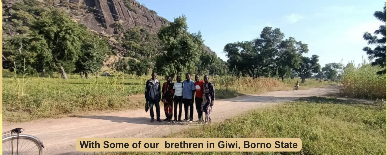
With Some of our brethren in Giwi, Borno State