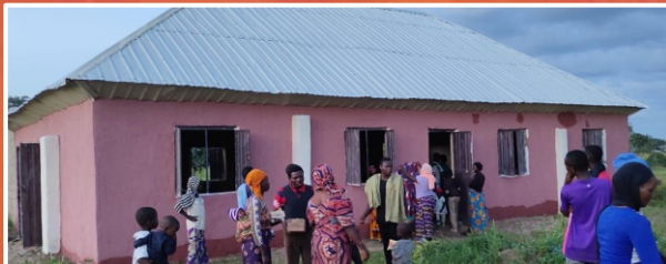
Completed Church Building in Bauchi State