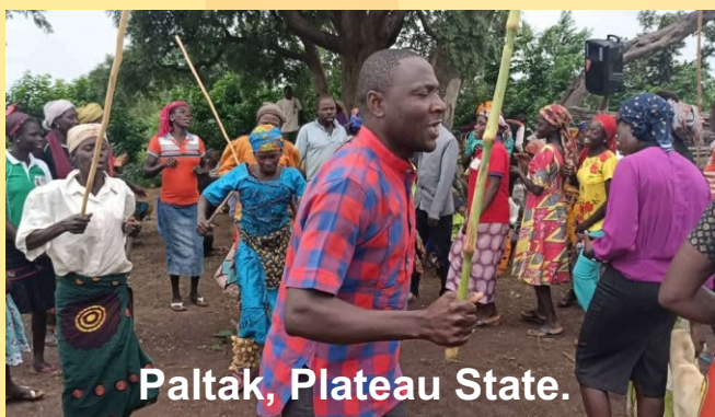
Paltak, Plateau State.