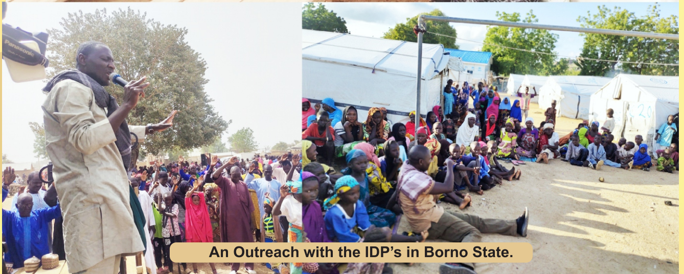
An Outreach with the IDP's in Borno State.