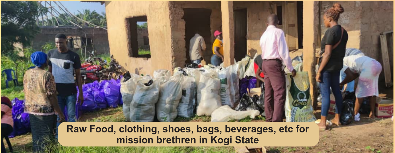
Raw Food, clothing, shoes, bags, beverages, etc for mission brethren in Kogi State