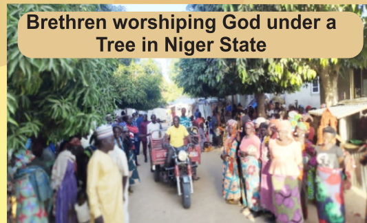
Brethren worshipping God under a Tree in Niger State