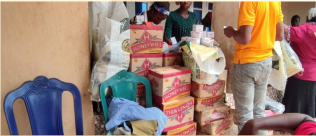
Raw Food, Clothing, shoes, bags beverages, etc for Zamfara mission outreach