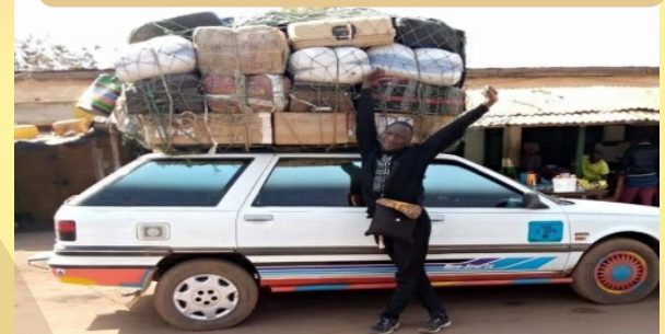
On mission trip to Liberia