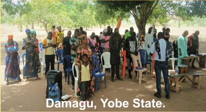
Damagu, Yobe State.