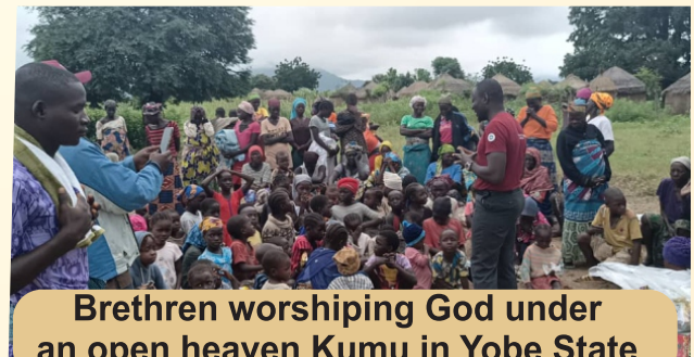
Brethren worshipping God under an open heaven Kumu in Yobe State