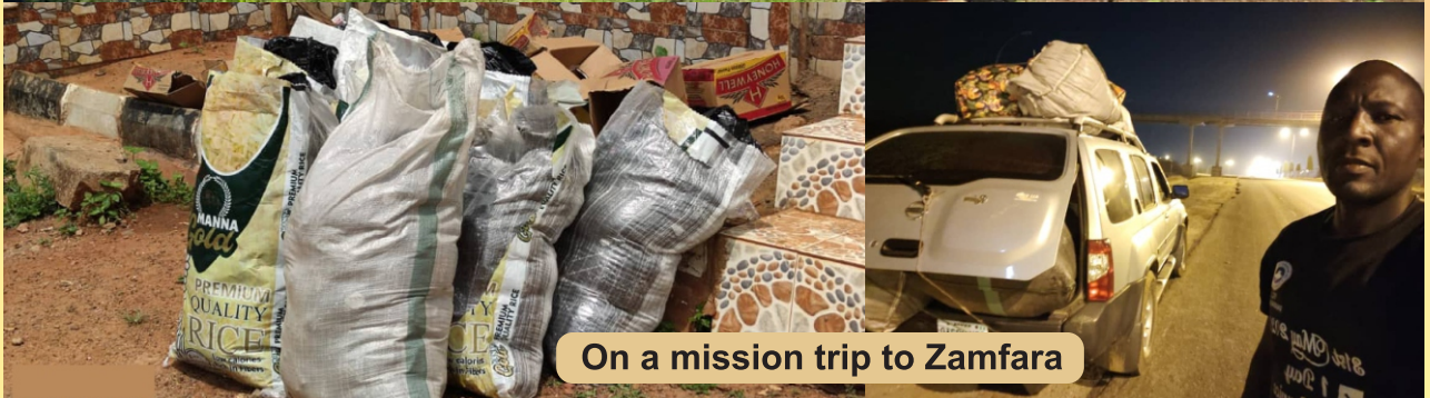
On a mission trip to Zamfara