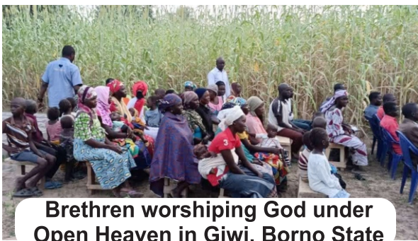
Brethren worshipping God under Open Heaven in Giwi, Borno State