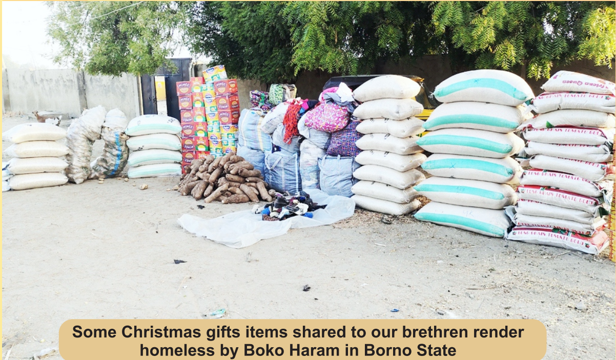
Some Christmas gifts items shared to our brethren render homeless by Boko Haram in Borno State