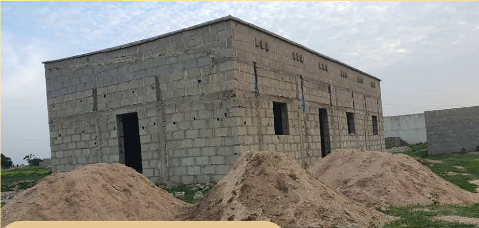
Kano State. Konan Dan-gora Mission church building project under construction.