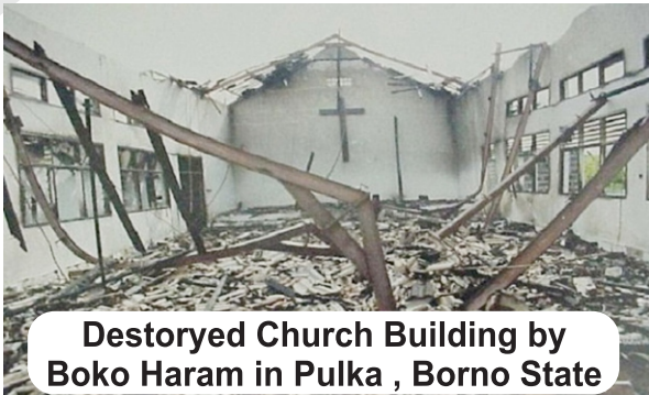
Destoryed Church Building by Boko Haram in Pulka , Borno State