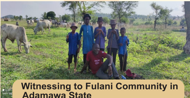
Witnessing to Fulani Community in Adamawa State