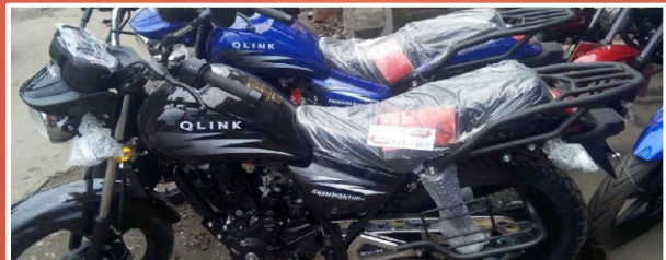
Desired Motor Bikes for the Missionaries