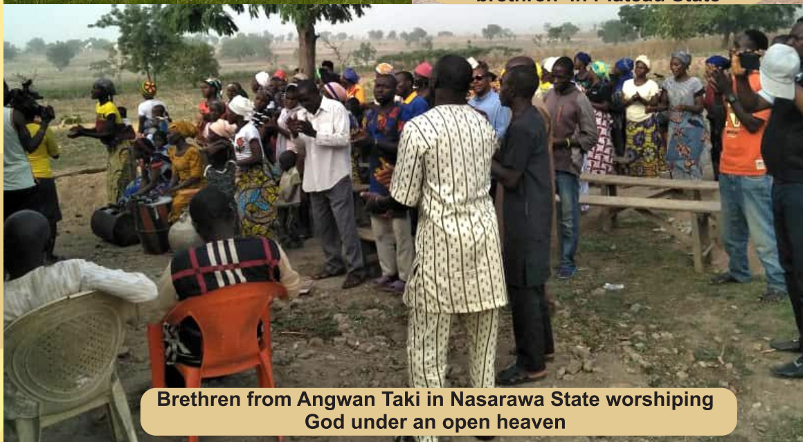
Brethren from Angwan Taki in Nasarawa State worshipping God under an open heaven