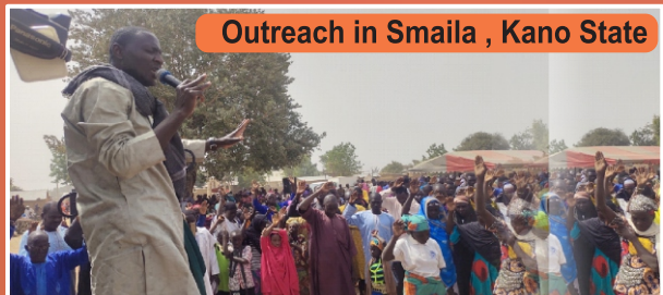
Outreach in Smaila , Kano State