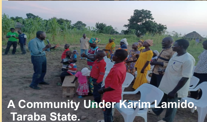
A Community Under Karim Lamido, Taraba State.