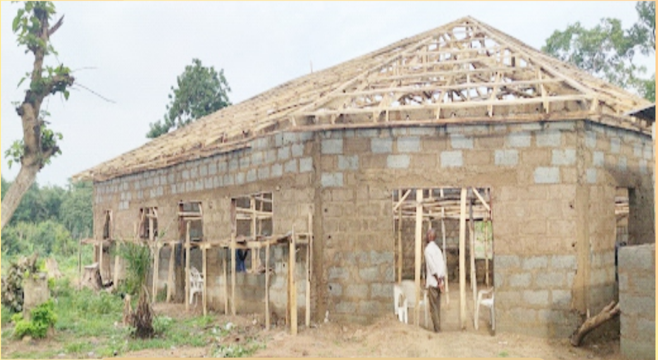
Church Building under construction for our Brethren that worship under tree in Durumi Communities