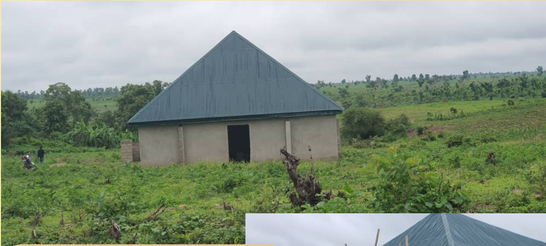
Nasarawa State. Kwanta Mission Church building project with, borehole and Pastor's house under construction.