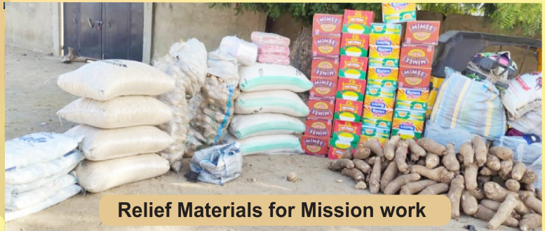
Relief Materials for Mission work