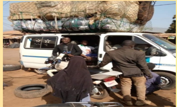
On mission trip to Sierra Leone