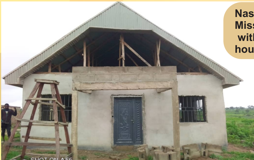
Nasarawa State. Angwan Shaho Mission Church building project with, borehole and Pastor's house under construction.