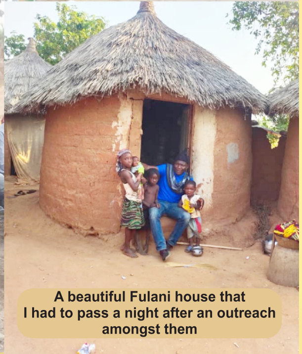
A beautiful Fulani house that I had to pass a night after an outreach amongst them