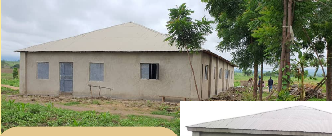
Nasarawa State. Ariga Mission Church building project with a School of six classroom, borehole and Pastor's house under construction.