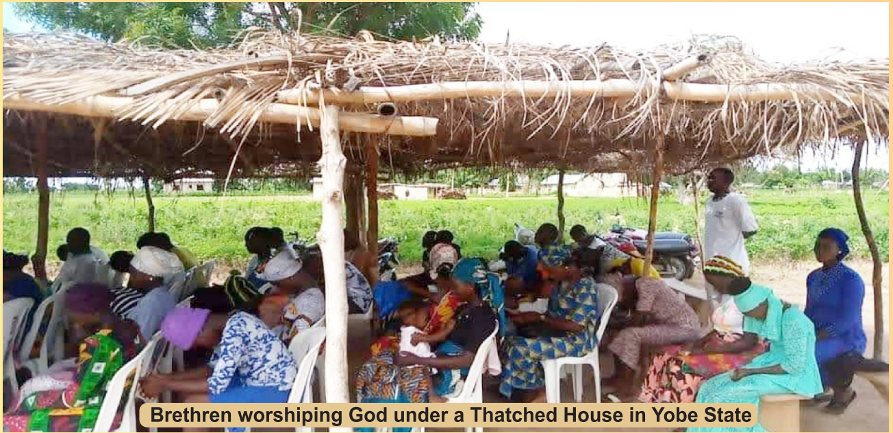
Brethren worshipping God under a Thatched House in Yobe State