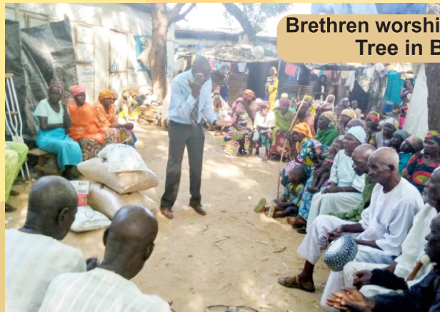
Brethren worshipping God under a Tree in Borno State