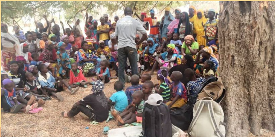
Our Brethren from Kantigwo, Gombe State worship under this Tree come rain or sunshine