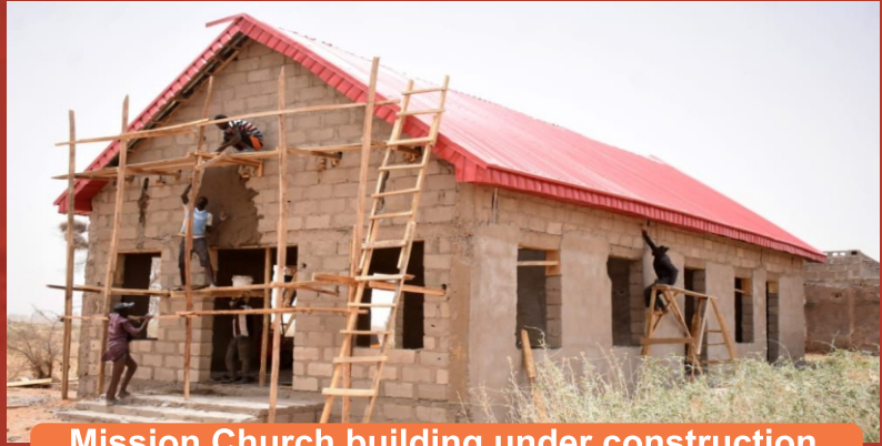
Mission Church building under construction