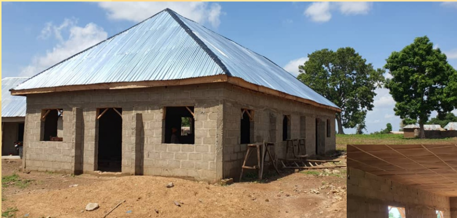
Kebbi State. Angwan Dorowa Mission church building project and Pastor's house under construction.