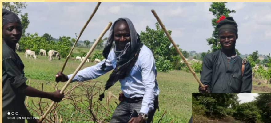
Sometime we have to cross the river half naked to witness to the people