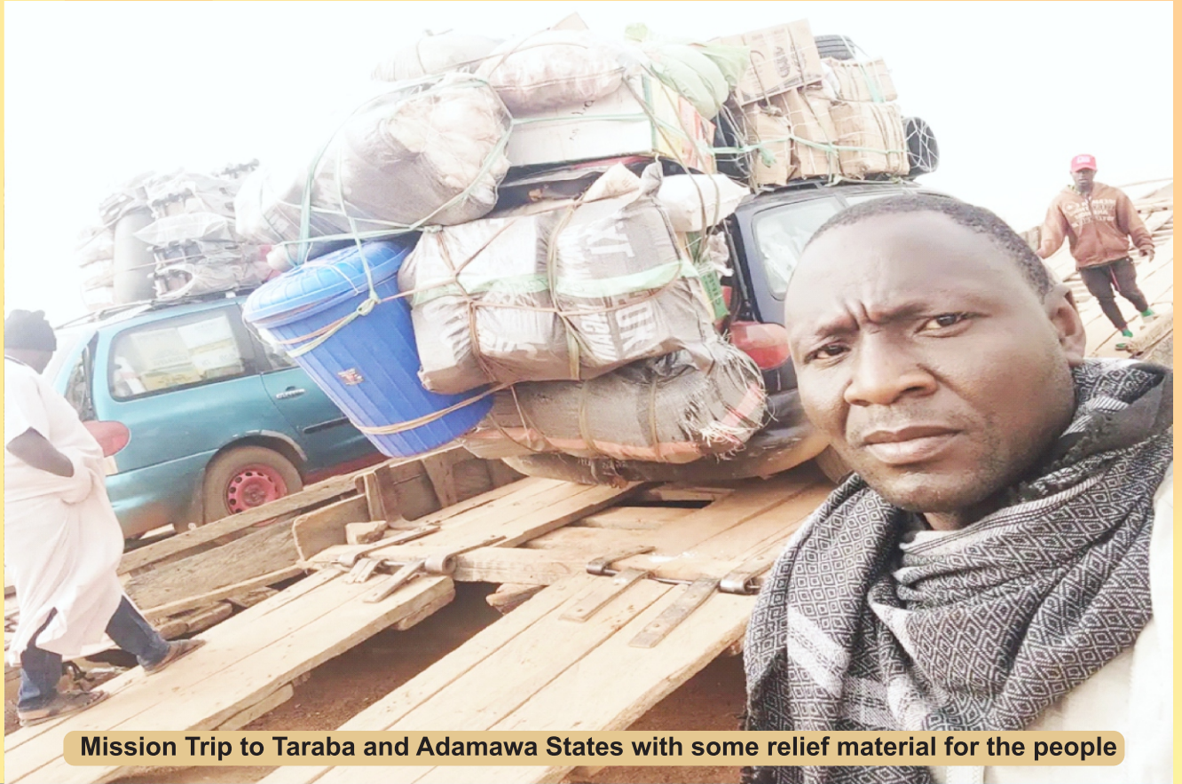
Mission Trip to Taraba and Adamawa States with some relief material for the people