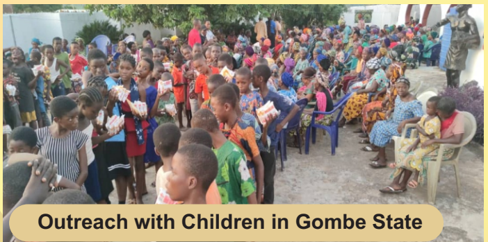
Outreach with Children in Gombe State