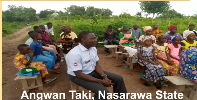
Angwan Taki, Nasarawa State