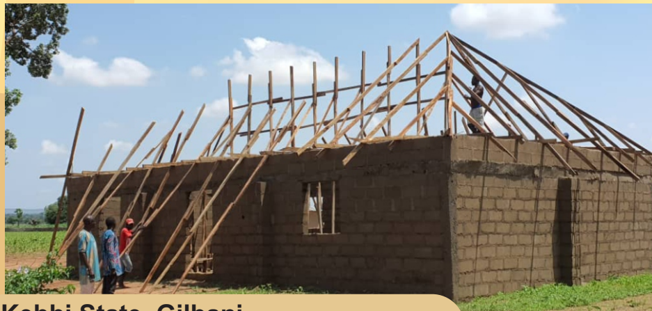
Kebbi State. Gilbani Mission church building project and under construction.