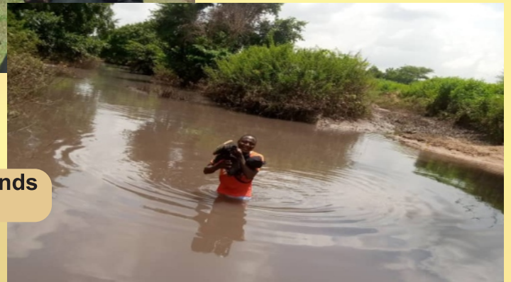
Catching fun with my fulani friends after ministering to them