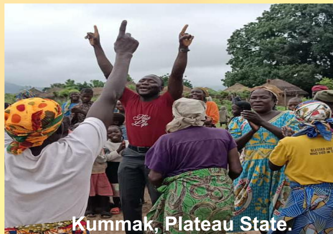
Kummak, Plateau State.