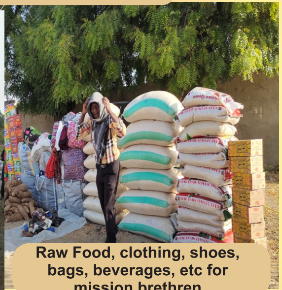
Raw Food, clothing, shoes, bags, beverages, etc for mission brethren