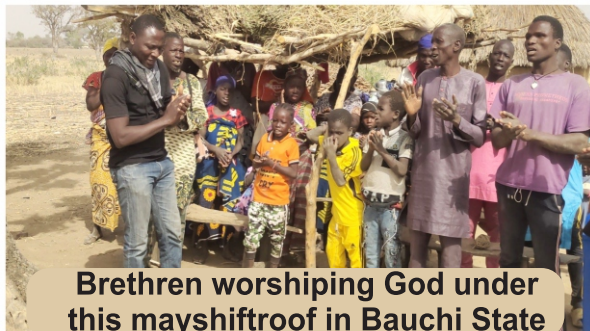
Brethren worshipping God under this mayshiftroof in Bauchi State

Over the years, Northern Nigeria has been plagued with insecurity challenges, namely: Boko Haram in the North East, banditry and kidnaping in the North West and North Central, Militant Herdsmen and terrorism in the Middle belt. The activities of these terrorists have crippled evangelism, impeded the growth of the Church, and threatened the existence of the body of Christ in the region. Many Churches have been burnt down, some demolished, Missionaries killed and entire Christian communities displaced.