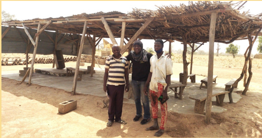
Our Brethren from Gilbani, Kebbi State worship in this place

Prior to the understanding of the depth of the situation in the missions' fields, the Lord had led me both to engage in missions efforts and support missionaries working among the unreached people groups.