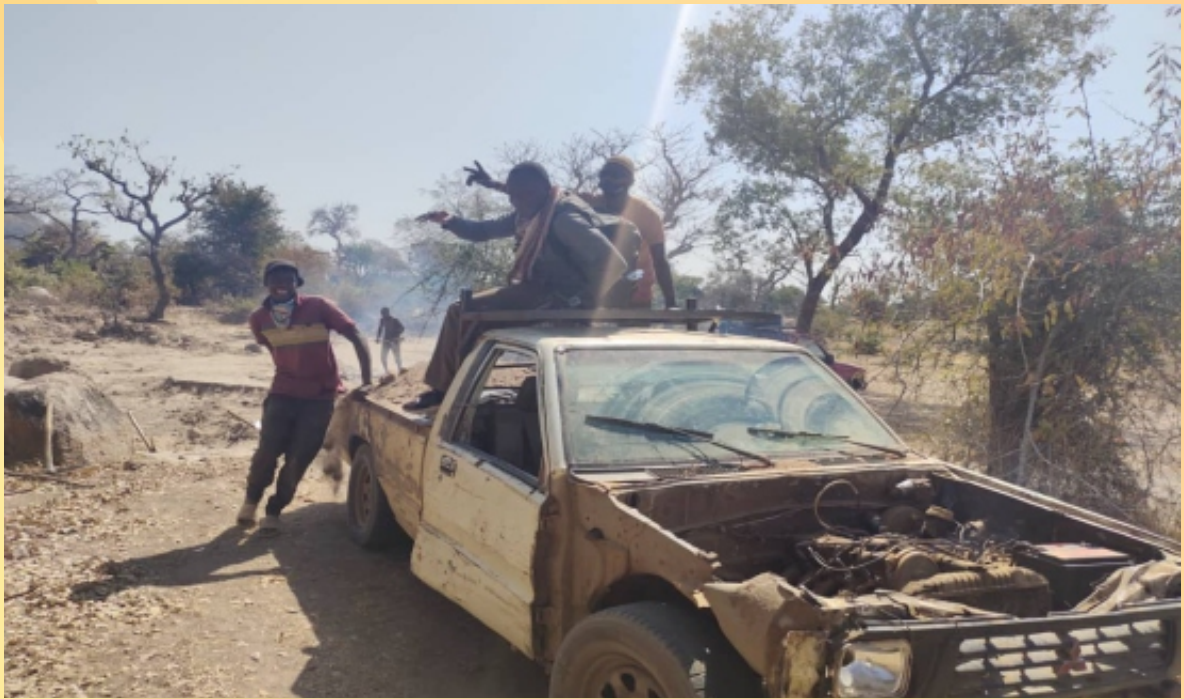
Running away from Boko Haram attack from Chibok heading to Askira-Uba, Borno State